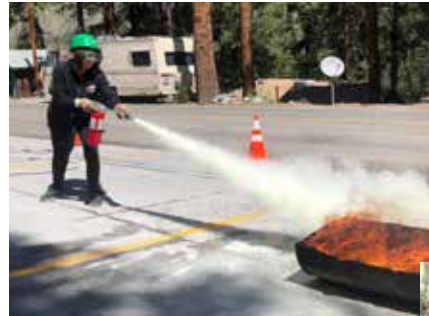
Hands-On Fire Training

First things first, CONGRATULATIONS to the recent graduates of the Basic CERT training course that was offered in April / May! These folks were learning responder techniques including Fire Suppression (hands-on Fire extinguisher practice), Light Search and Rescue techniques including using the right tools to lift heavy objects and safely removing victims from dangerous buildings, Splinting and disaster medical techniques, leadership skills, State and County Disaster communication protocols and more! Thank you so much for all time and effort put to accomplish this course of training!