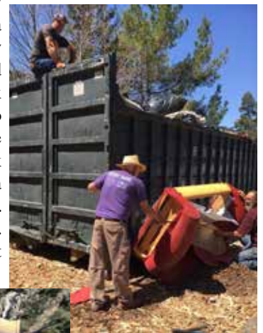
Big Bin at MHV