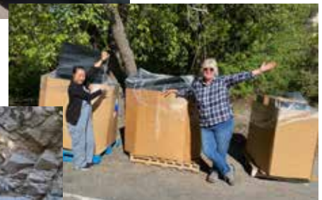
E-Waste at Fallsvale