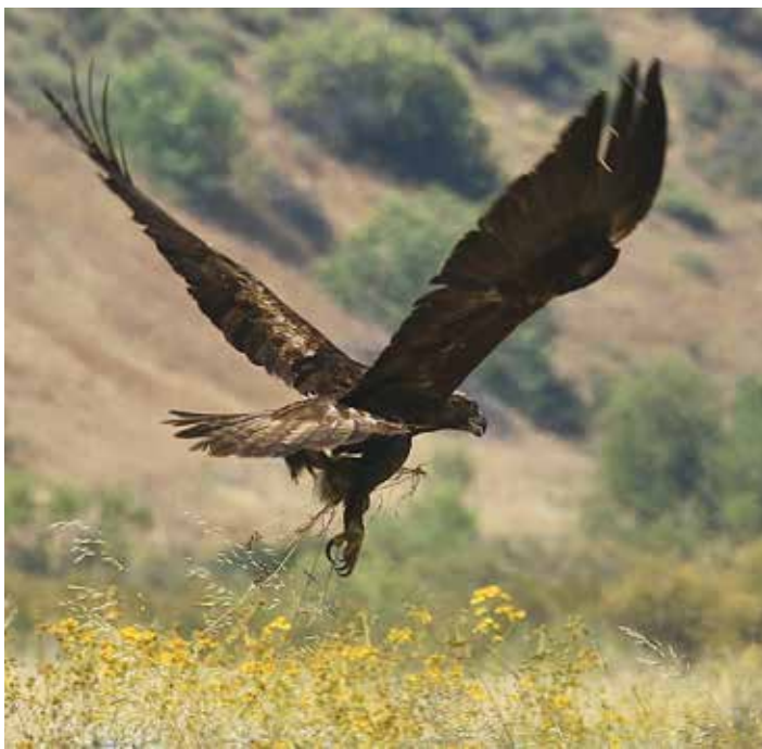
Golden Eagle near Hwy 38