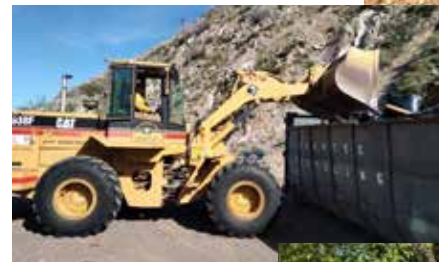
Loader at Big Horn Flats (previously the Cinder Pile)