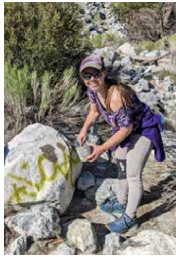
Residents and Volunteers Getting Busy!

A Big Thank You to all Canyon Clean-up Volunteers! Sponsored by Mountain CARE.