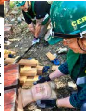
Rescue done right

Since the pandemic was identified, the county and even the state have put the redlight on any training that, we as a team have been able to offer. As a matter