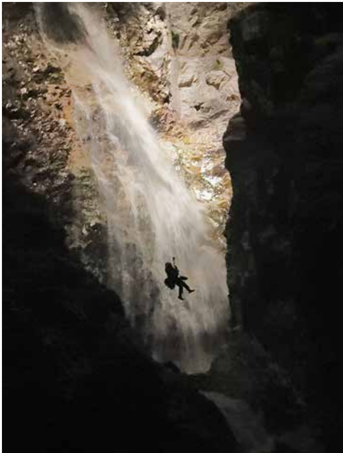
Night Rescuer putting it on the line